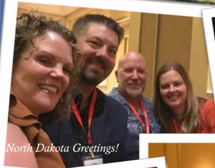
North Dakota Greetings!